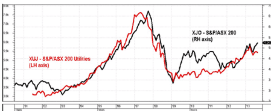
Comparing the Top 200 index (XJO) to the Utilities index (XUJ) 2000 - 2013

The monthly price chart below shows the S&P/ASX 200 index (XJO), fondly referred to as the Top 200 (even though they are not strictly the largest 200 stocks on our market) and the S&P/ASX 200 Utilities index (XUJ). Notice they are closely correlated most of the time - that is, they generally tend to follow each other.