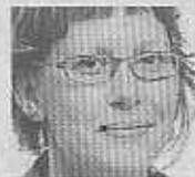
TECHNICAL ANALYSIS LUCY BATTERSBY

THE upward momentum of share prices in Australian mining companies has softened in recent months on speculation that the US economy's growth will remain sluggish and that infrastructure stimulus programs in Asia may be slowing.