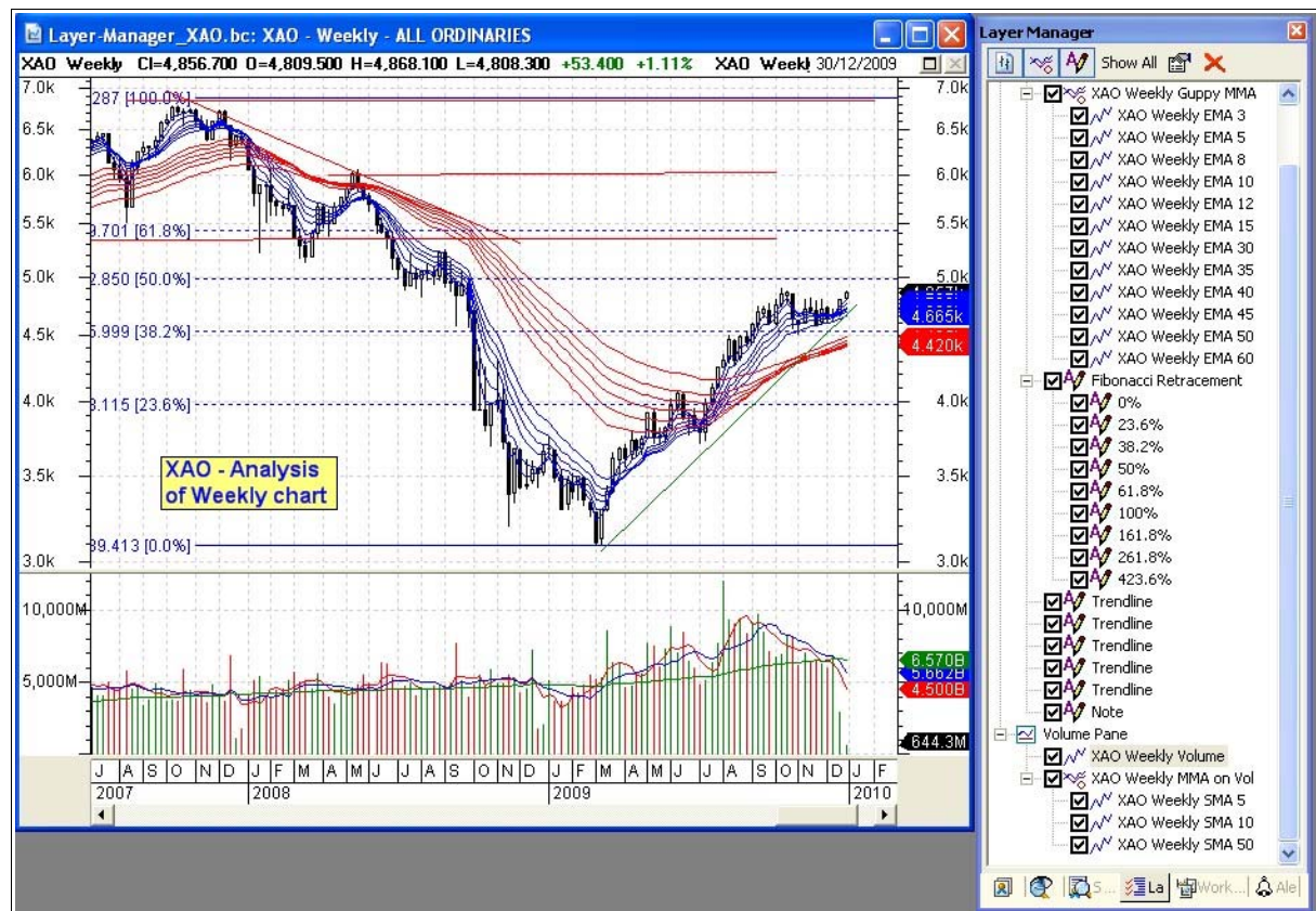
Figure 1: Layer Manager - What is it? How to use it?