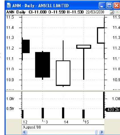
Figure 1: A simple (but complex) candlestick chart.

Take a look at Figure 3 below. This is a screenshot of what is known as the market depth . This snap