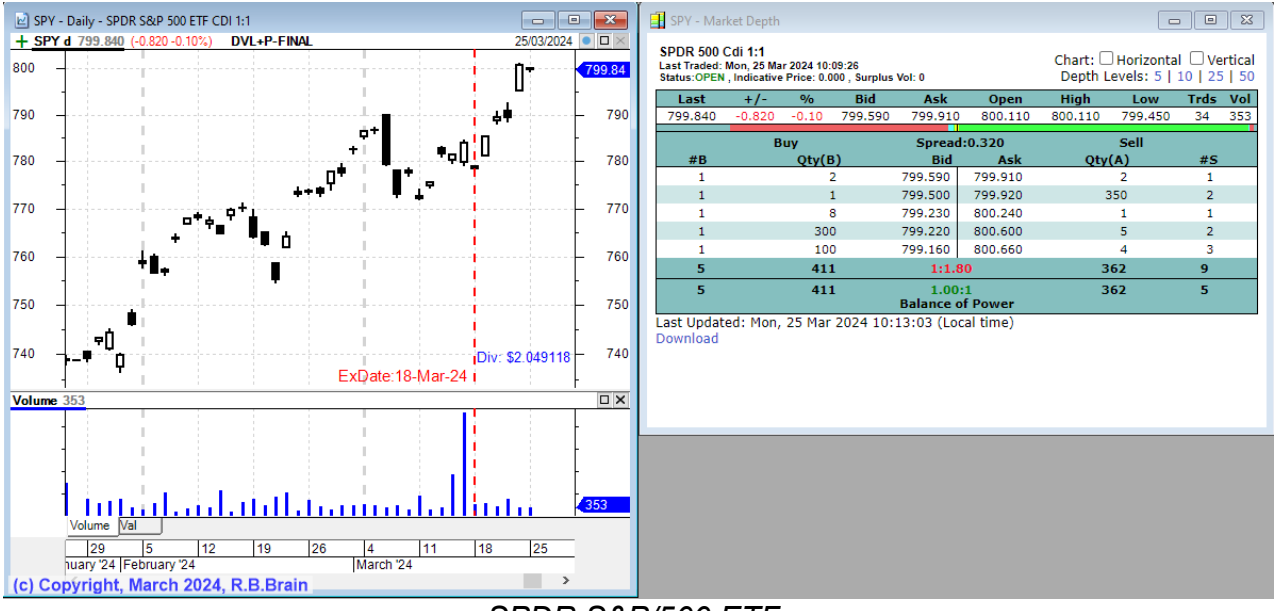
SPDR S&P/500 ETF and Market Depth (at 10.10am, Monday 25 March 2024)

Not to be confused with the SPI futures contract.