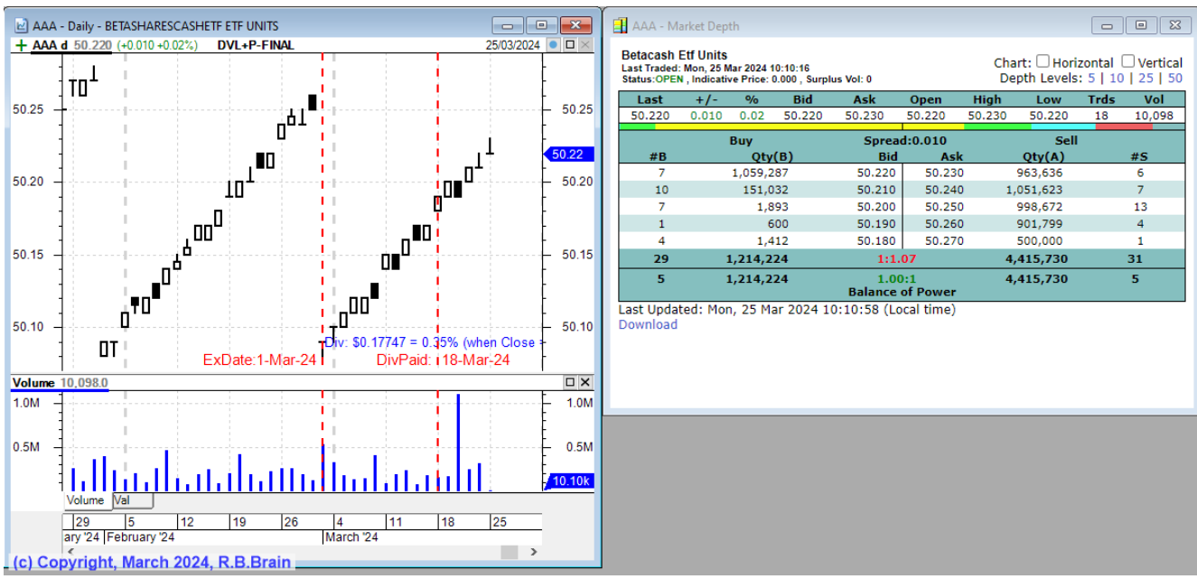
Betashares AAA ETF and Market Depth (at 10.10am, Monday 25 March 2024)

One of the many ETFs that are offered by Betashares, the AAA ETF: "...aims to provide exposure to Australian cash deposits, with attractive monthly income distributions that exceed the 30-day Bank Bill Swap Rate (BBSW) (after fees and expenses)".