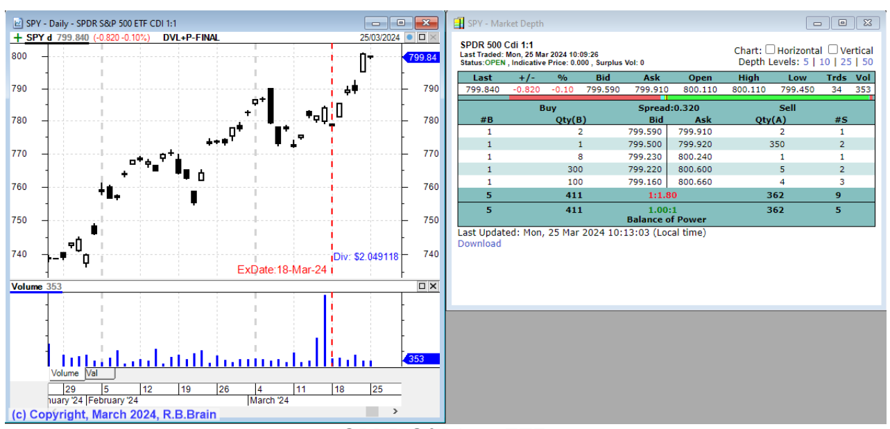
SPDR S&P/500 ETF and Market Depth (at 10.10am, Monday 25 March 2024)

Not to be confused with the SPI futures contract.