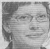
TECHNICAL ANALYSIS LUCY BATTERSBY

The S&P/ASX 200 had recently been opening the trading day strongly but closing weakly, Mr Brain said. This suggested the market was overpriced and increased the likelihood that the megaphone pattern would end by falling below the support line.